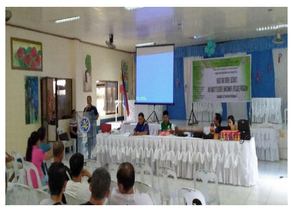
Figure 4. Presentation of the objectives of the program to the constituents.

"Disaster Preparedness is needed, as we are experiencing floods in our community and training will be helpful for us." (Community Leader 3).